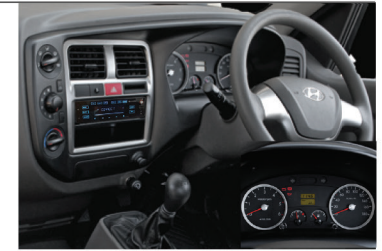
Efficient gauge cluster design