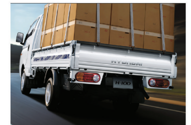
Rear Flat High Deck