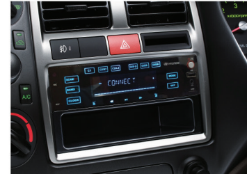
AM/FM/BT/AUX/USB Audio System