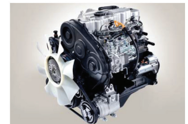
Naturally Aspirated 2.6L diesel engine

Disclaimer: For exact models, specifications and colors – please consult your Hyundai dealer. Some of the equipment illustrated or described in this leaflet may not be supplied as standard equipment and may be available at extra cost. Hyundai Nishat Motor (Private) Limited reserves the right to change specifications and equipment without prior notice.