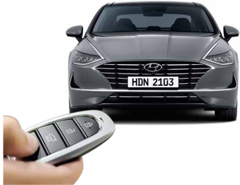
Remote engine start

The SuperVision cluster seamlessly integrates an expanded array of information presented in clear, concise and colorful graphics. By automatic adjustment of the transmission shift schedule, the integrated driving mode offers the driver a choice of five types of drive settings to suit drive preference, each displayed in its own specific color.