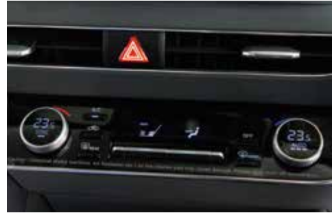
Dual zone automatic climate control