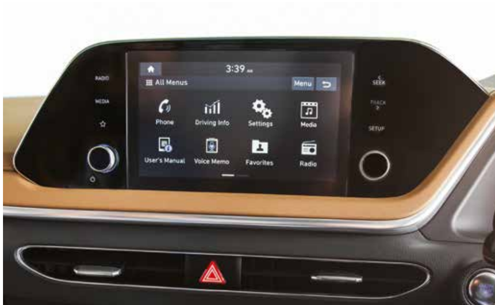
8" floating infotainment system display

The floating infotainment display offers you latest features and connectivity, while you nestle comfortably in the Leather upholstered luxury seats.