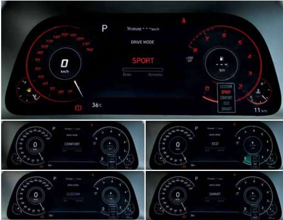
12.3 inch full LCD cluster/Integrated driving mode (Comfort/Smart/Eco/Sport/Custom)

Step inside and discover an interior that engages and satisfies all the senses. The cabin is a visual feast projecting elegance and warmth while delivering a rich tactile experience. The dials of the SuperVision cluster come to life with stunning clarity and show impressive depth. Numbers and batons are crisp and clean with the gauges scoring big points for their elegance and functional simplicity.