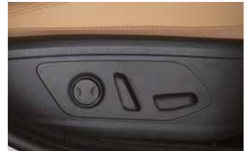
Driver's 10-way powered Seat + 4 way powered Passenger Seat