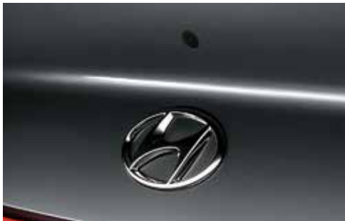
Rear camera and concealed boot lid button