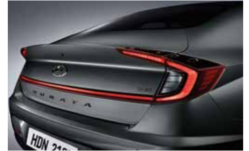
Horizontal LED Rear Tail lights with LED turn signal lamps