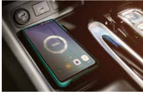
Wireless smartphone charging system