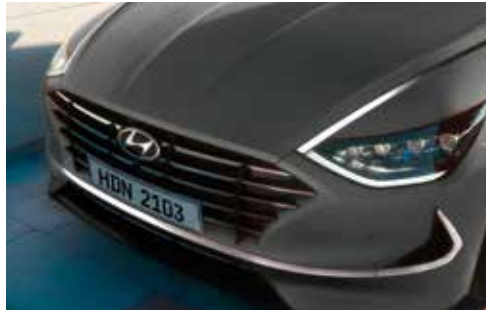
Black & Chrome coating radiator grille