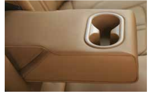
Arm rest (rear seats)