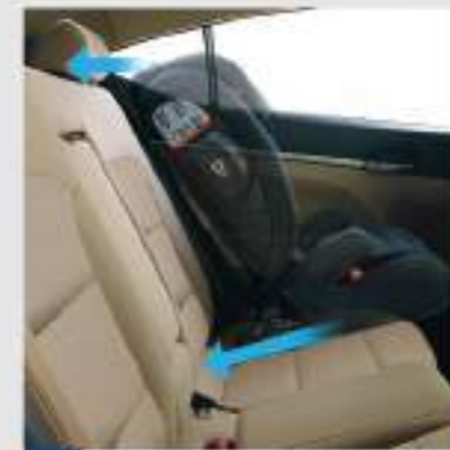
ISOFIX Child Seat