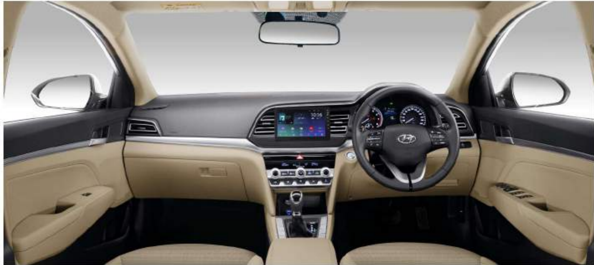
Beige two-tone Interior