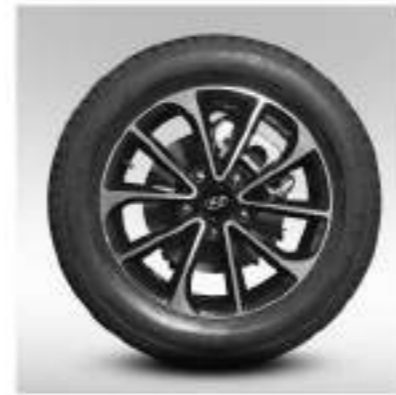
Spare 16" Alloy Wheel