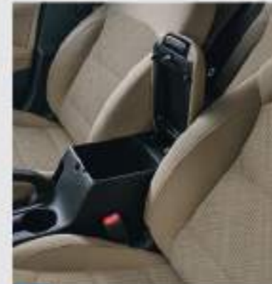
Front Console Box