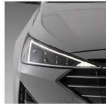
Daytime Running Light (DRL)