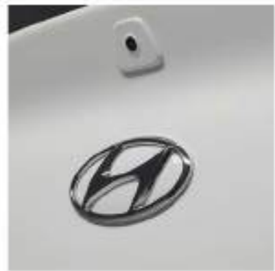
Concealed Boot Lid Button