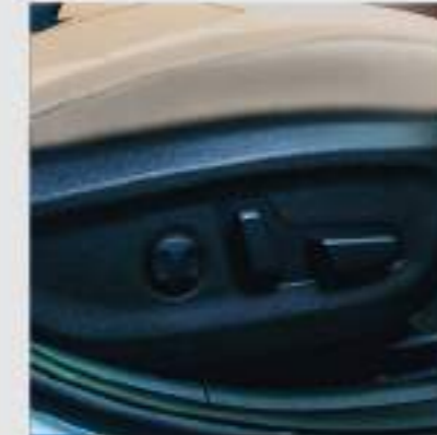
8-Way Powered Driver Seat