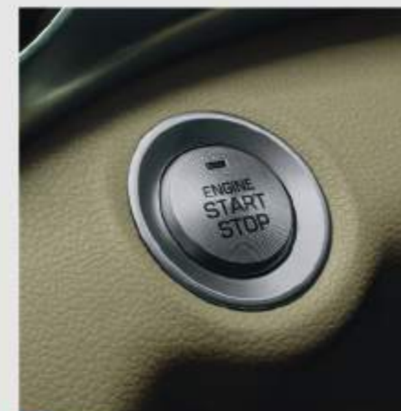
Engine Start/Stop Button

The engine starts quickly at the press of a button when the Smart Key is inside the vehicle.