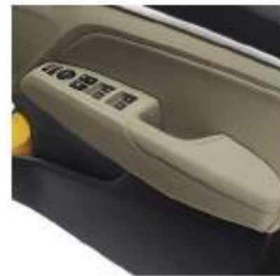
Front Door Armrest with Map Pocket