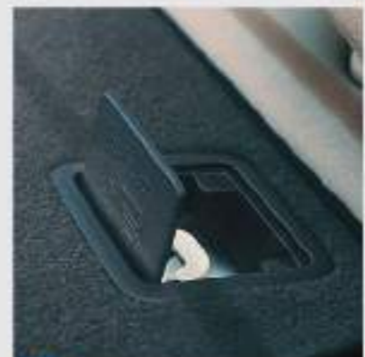
ISOFIX Anchor Points Are situated behind the rear seat head rest.