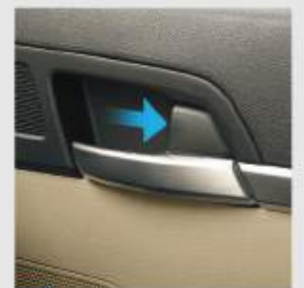
Speed Sensing Door Lock Automatically locks car doors when the car reaches a certain speed.