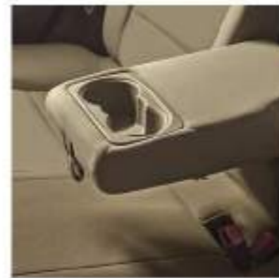
Rear Arm Rest with Cup Holder