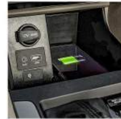
Wireless Phone Charging