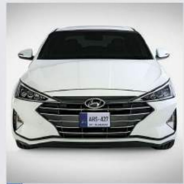
Hexagonal Radiator Grille Hyundai's signature hexagonal front grille creates a bold and dynamic design identity.