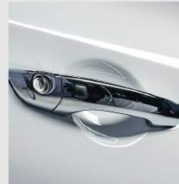
Smart Door Handle

When you open the doors to the future, it has to be in style. Equipped with the innovative and advanced Smart Entry system, the Smart Door handles illuminate as you move to enter.