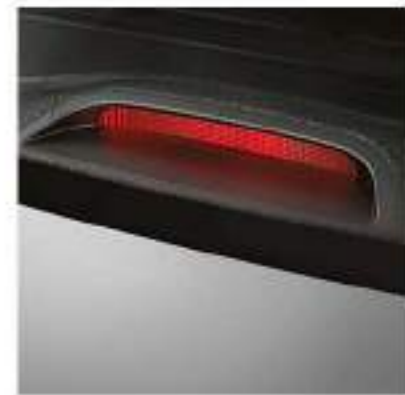
High Mounted Stop Lamp