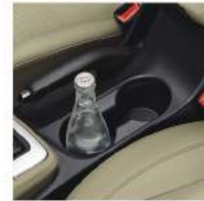
Front Cup Holders