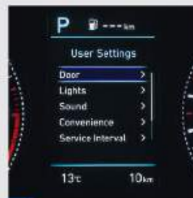
Supervision w/4.2" TFT LCD Screen

Get a precise digital reading of your speed.