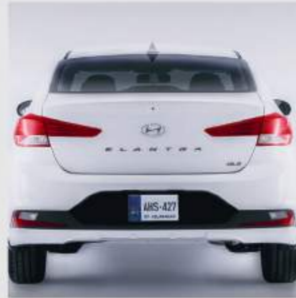
Sporty Bumper with Reflectors