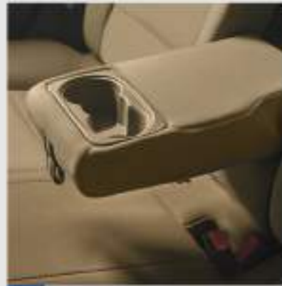
Rear Armrest with Cup Holder

The rear seats can be folded flat in 60:40 ratio and create a conveniently versatile load space.