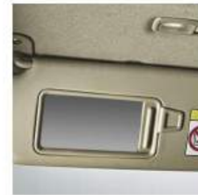
Vanity Mirror with Illumination