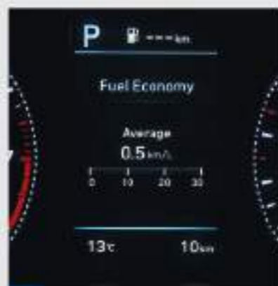
Fuel Economy Screen