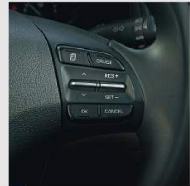
Auto Cruise Control