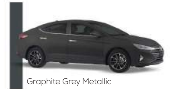
Graphite Grey Metallic