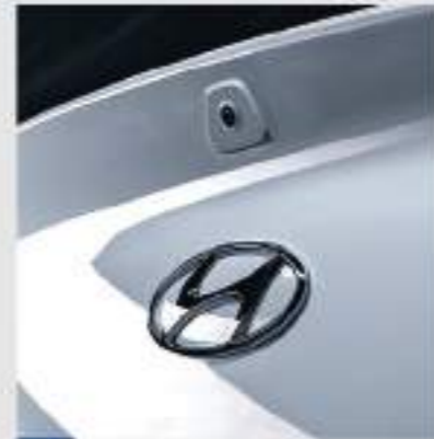
Rear Camera with Dynamic Parking Guidelines