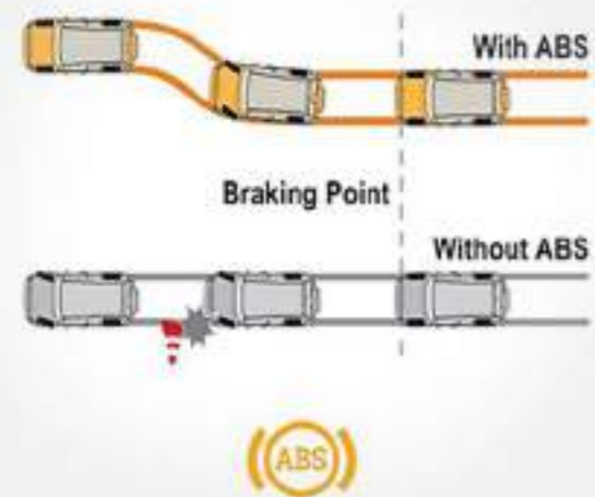
ABS with EBD & BA

Provides optimal control to the engine steering device during sudden braking and turning, in order to maintain vehicle stability.