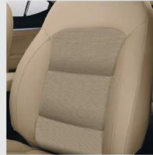
2-Way Powered Lumbar Support

Discover Hyundai's secret for comfort in the fully adjustable, 10-way powered driver seat, which comes fully equipped with Lumbar Support.