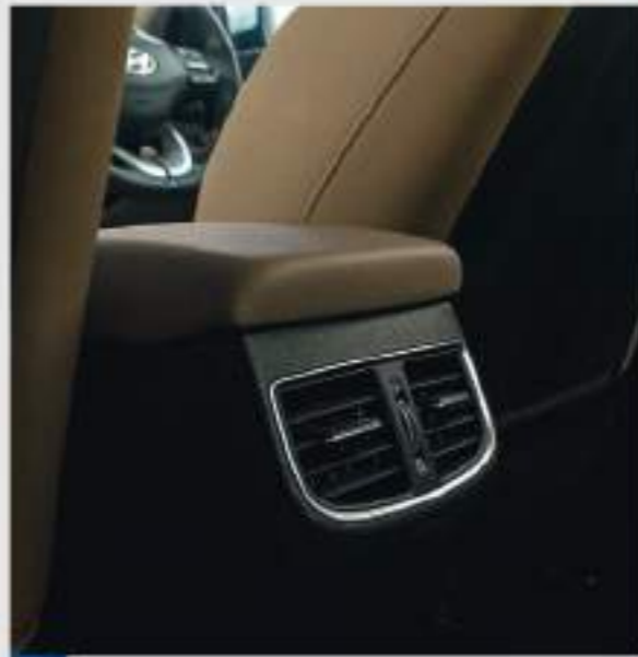
Rear AC Vents