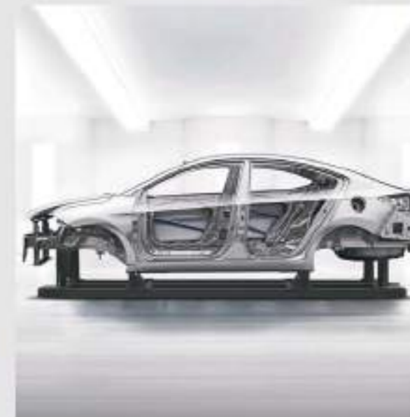
High Strength Steel Extended application of Ultra High Tension Steel Plate reinforces chassis rigidity.

The highest convenience in the class is provided by new technologies related to advanced riding safety, such as the Dual SRS Airbags.