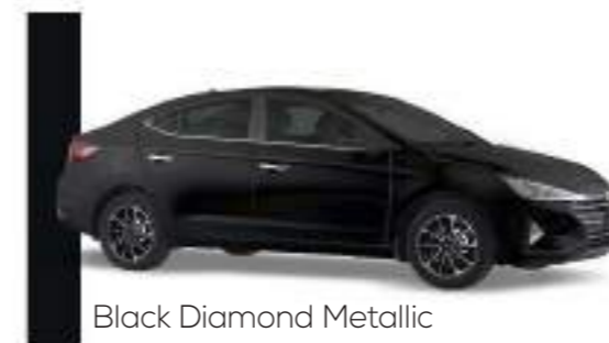
Black Diamond Metallic