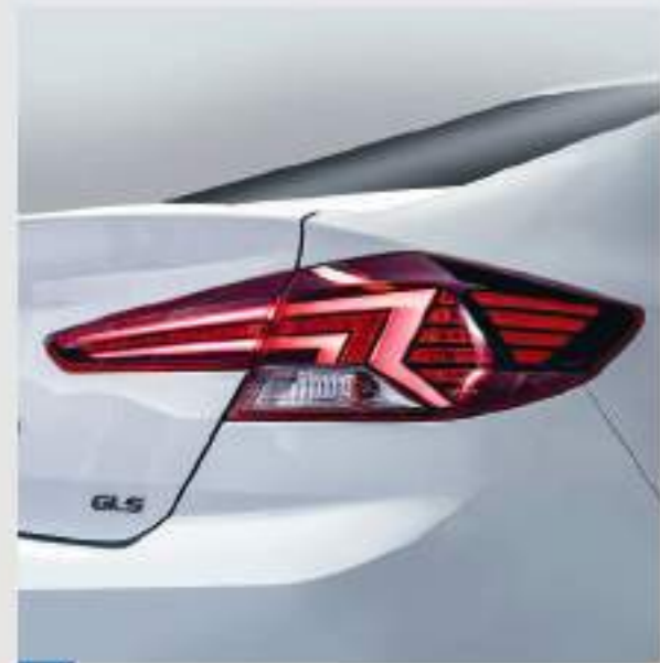
LED Rear Combination Lamp Produces a multi-dimensional and premium feel using high-tech graphic details.

The ELANTRA comprises of a dynamic, moderate and sophisticated profile, and offers a modern, sporty and future oriented design.