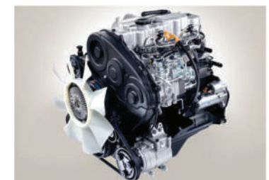
Naturally Aspirated 2.6L diesel engine

Disclaimer: For exact models, specifications and colors – please consult your Hyundai dealer. Some of the equipment illustrated or described in this leaflet may not be supplied as standard equipment and may be available at extra cost. Hyundai Nishat Motor (Private) Limited reserves the right to change specifications and equipment without prior notice.