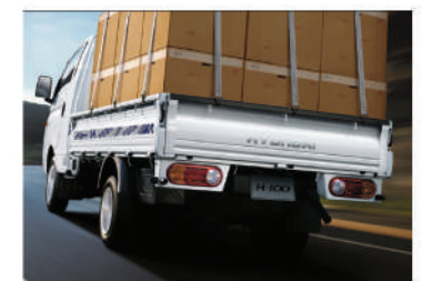
Rear Flat High Deck