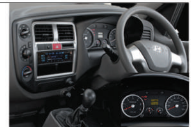
Efficient gauge cluster design