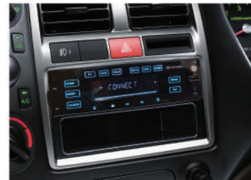
AM/FM/BT/AUX/USB Audio System