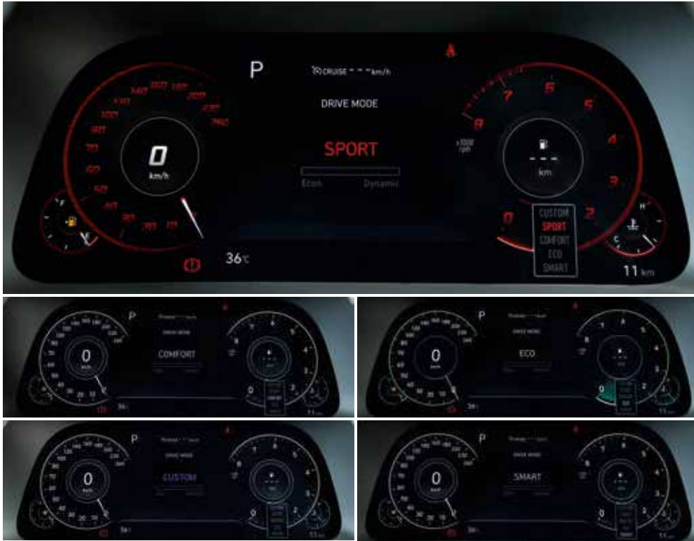
12.3 inch full LCD cluster/Integrated driving mode (Comfort/Smart/Eco/Sport/Custom)

Step inside and discover an interior that engages and satisfies all the senses. The cabin is a visual feast projecting elegance and warmth while delivering a rich tactile experience. The dials of the SuperVision cluster come to life with stunning clarity and show impressive depth. Numbers and batons are crisp and clean with the gauges scoring big points for their elegance and functional simplicity.