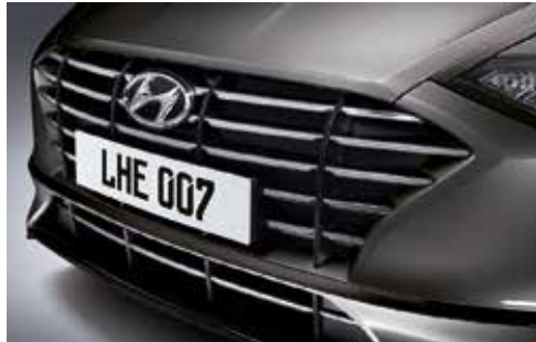
Black & Chrome coating radiator grille