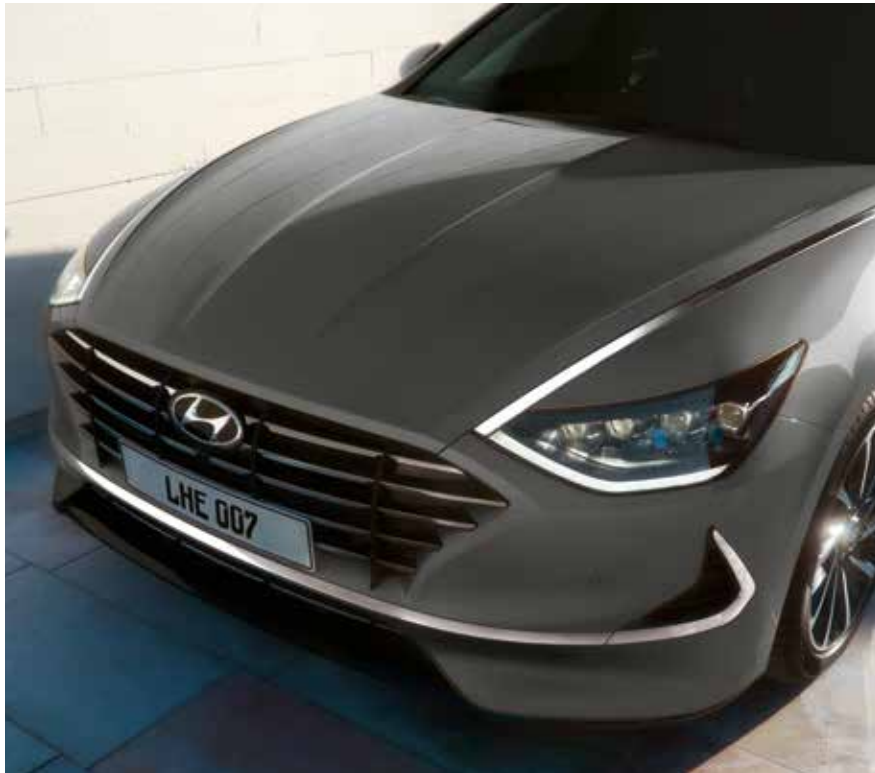
Radiator grille/LED daytime running lights (DRL)/LED Projection headlamps/front parking sensors

Sonata's high style not just sparks the emotions but also delivers high rewards with innovative design features like the gradient hidden light technology, a sure conversation starter that adds to Sonata's mystique. Sonata's high-tech image is reinforced with LED rear combination lamps and available full-LED front lighting. For a statement that expresses high performance, Hyundai offers an 18-inch alloy wheel package and premium Pirelli tires.