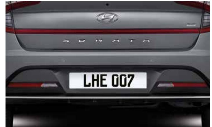
Sporty rear bumper/Rear parking sensors/Rear camera