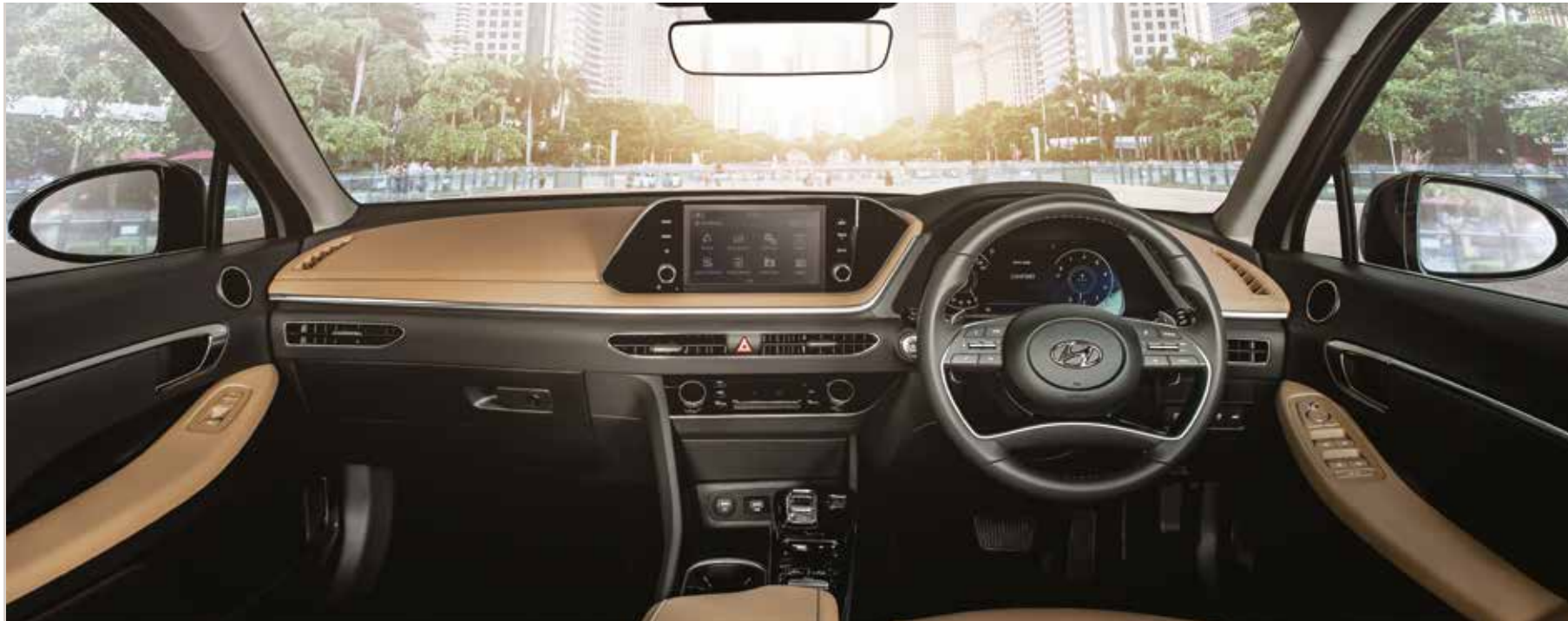
Camel two-tone interior