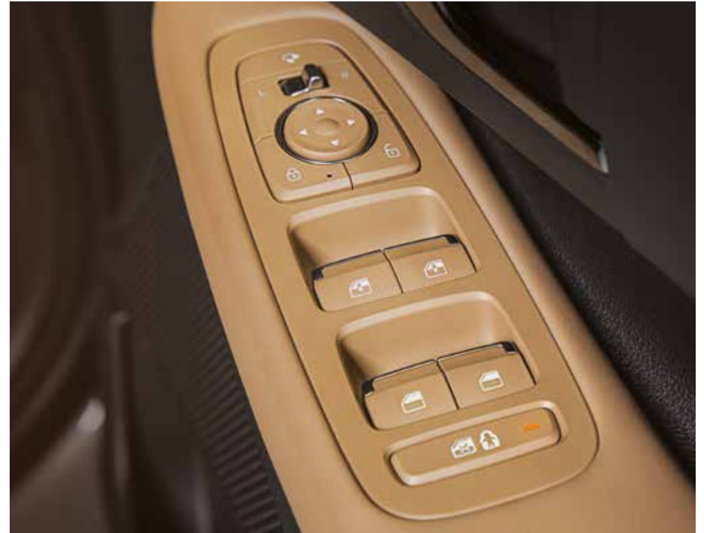
Auto child lock