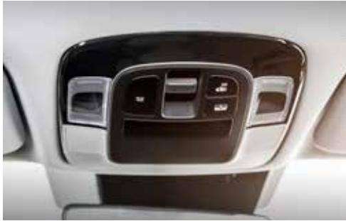
Front personal LED Lamps