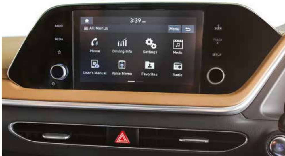
8" floating infotainment system display

Sonata has a way of becoming a part of you, an extension of your body. Its seats cradle you while gauges, control knobs and pedals align perfectly with eyes, hands and feet for a sense of complete confidence and total control. The floating infotainment display offers you latest features and connectivity, while you nestle comfortably in the Leather upholstered luxury seats.