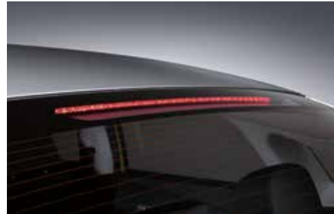
LED high mount stop lamp