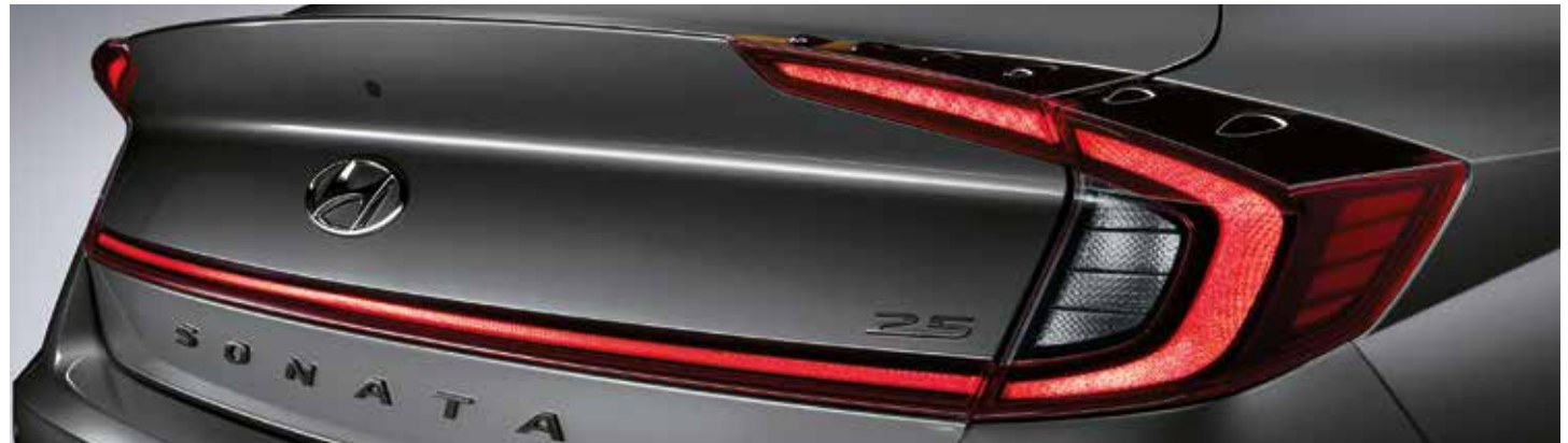
Horizontal LED rear combination tail lights

The design cues continue towards the rear. The connected LED Rear lamps are incorporated with rear air fins which create a unique style and enhance aerodynamic performance. The rear bumper design and extended LED lights provide a broad stance, giving Sonata its perfect blend of sporty and classy look. Rear parking sensors, smart trunk opener and rear LED fog lamps further provide the driver convenience on journeys long and short.