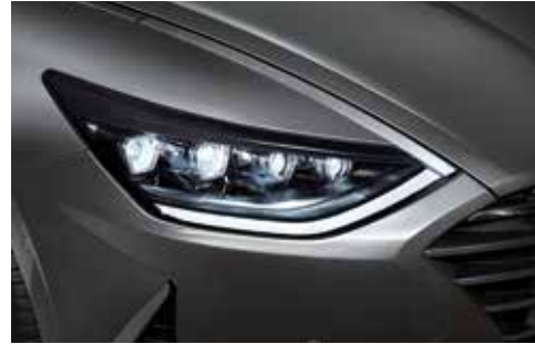
LED headlamps (Projection type)/Daytime running light (LED)