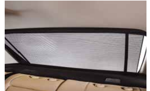
Powered rear curtain