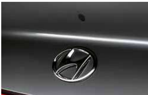
Rear camera and concealed boot lid button