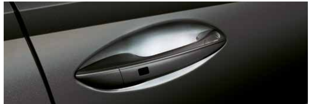
Smart door handle with welcome light