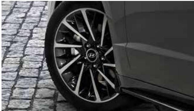
18 inch Alloy wheels