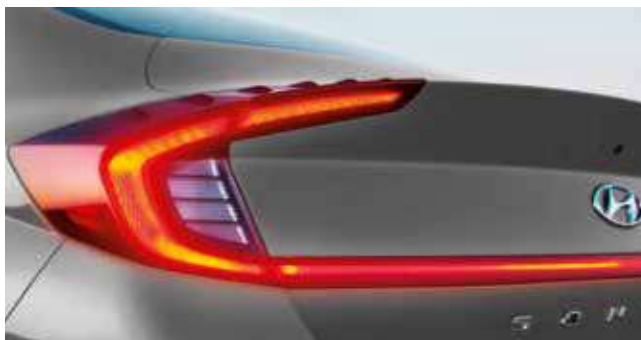
Horizontal LED rear combination tail lights