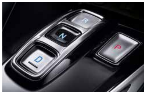
Shift-by-wire 6-Speed automatic transmission