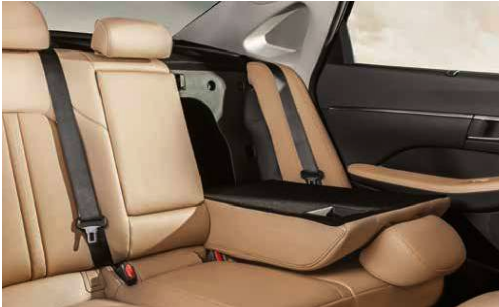
60:40 split folding seats

Sonata takes equally good care of its passengers with seats that bolster and support the spine's natural S-curve so you can really feel the difference that good design makes. The relaxation comfort seat allows the front passenger to unwind by replicating the spinal support of a reclining chaise lounge to achieve a feeling of near weightlessness.