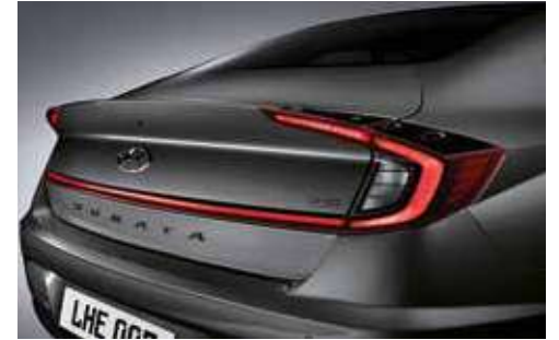
Horizontal LED Rear Tail lights with LED turn signal lamps