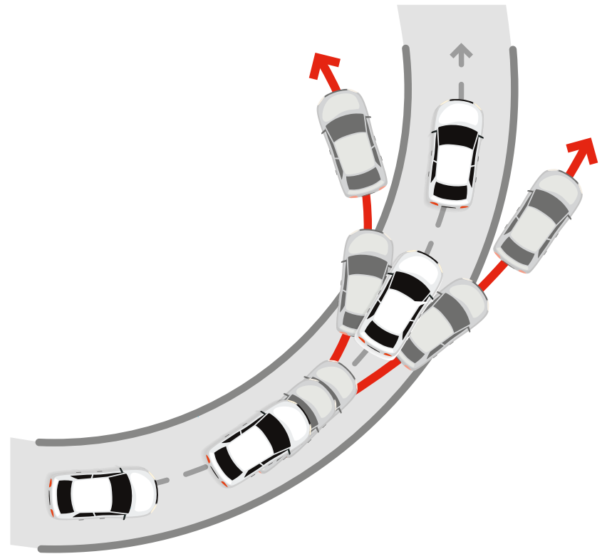
Electronic Stability Control (ESC) and Traction Control