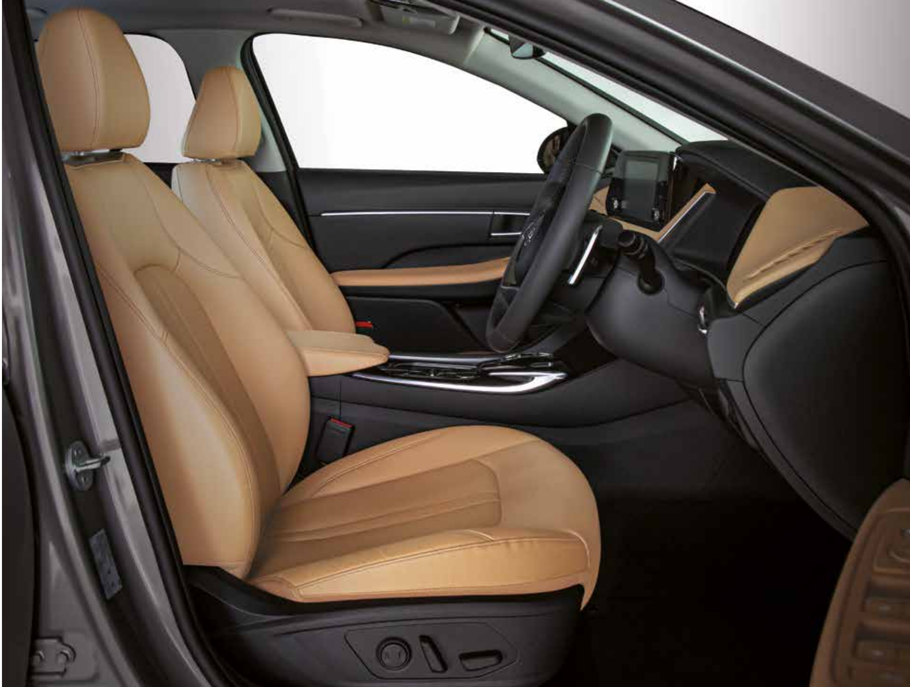
10-way powered driver seat with lumbar support