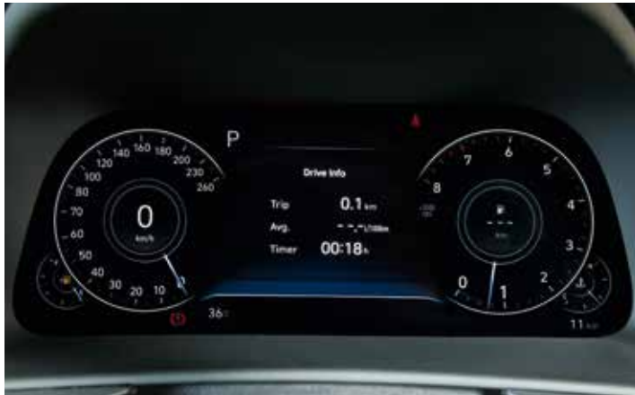
12.3" high resolution TFT LCD

Sonata flexes its muscles on command to keep you feeling confident and in charge of all driving situations. Whether cruising along the open highway or working through stop-and-go city traffic, there's a nimble yet dynamic quality that calms, relaxes and satisfies the driver. Steering is light yet precise and the ride is silky smooth. Premium appointments such as the head-up display and SuperVision gauge cluster further elevate driver's awareness and safety.