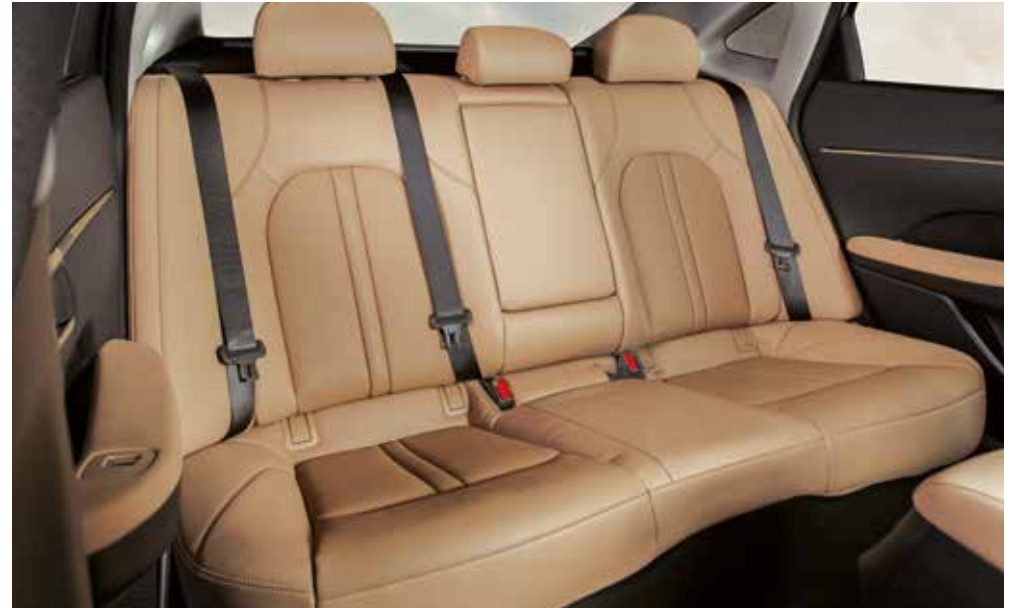
Rear seat with armrest