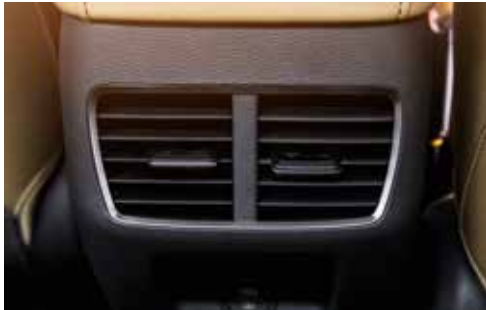
Rear AC vents