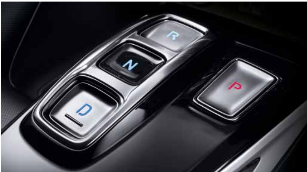
Shift-by-wire automatic transmission

180 Maximum Power HP/6,000 rpm 232 Maximum Torque nm/4,000 rpm