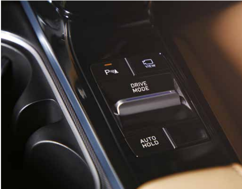
Auto brake hold

A road mishap may not be on your radar, but Hyundai Sonata is best-in-class when it comes to your safety. All geared up with Auto Brake Hold, Electronic Parking Brake, Electronic Stability Control, Hill-Start Assist, ISOFIX Child Seat Anchors and 6 Airbags. Sonata's top-notch safety technology loves and protects you like family.