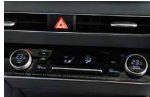
Dual zone automatic climate control