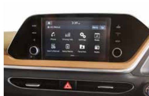
8" Floating infotainment system display