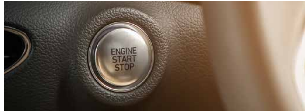
Push start button

Lost or misplaced recharging cords? The cord is a thing of the past with the wireless smartphone charging system that ensures your phone will never go dead.