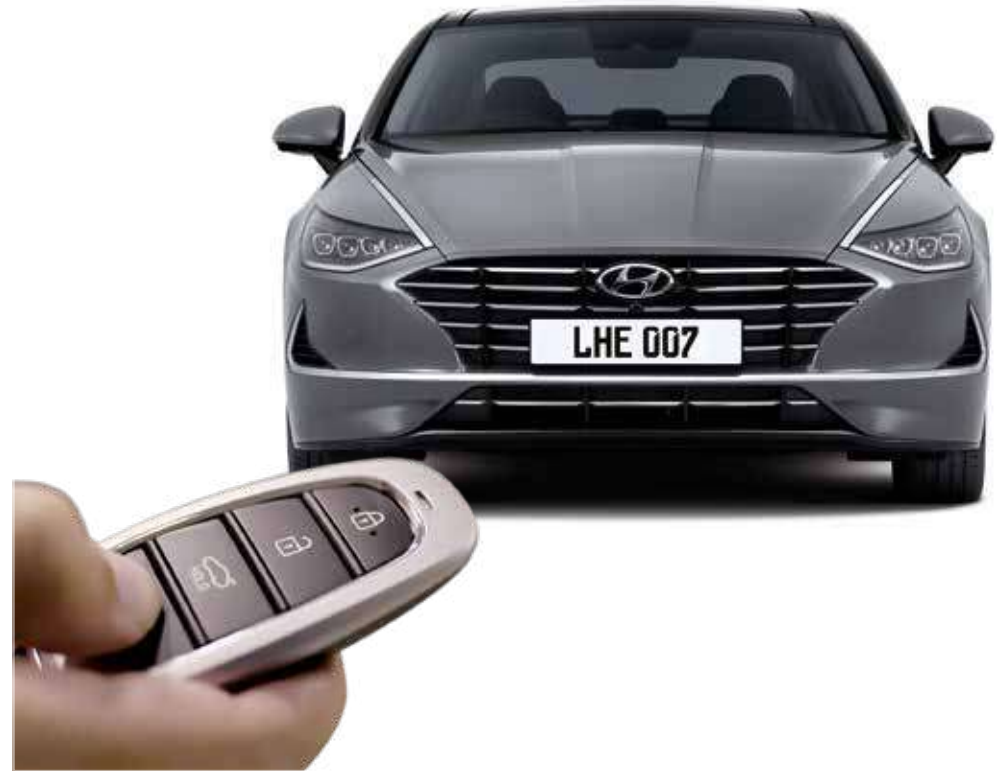
Remote engine start

The SuperVision cluster seamlessly integrates an expanded array of information presented in clear, concise and colorful graphics. By automatic adjustment of the transmission shift schedule, the integrated driving mode offers the driver a choice of five types of drive settings to suit drive preference, each displayed in its own specific color.